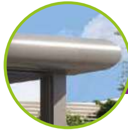
Round gutter edge with overhang with LED possibility