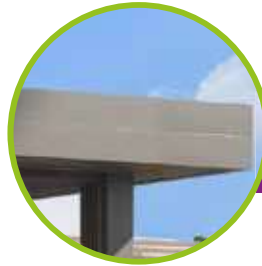
Modern gutter edge with overhang with LED possibility