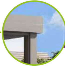
Modern gutter edge (standard)